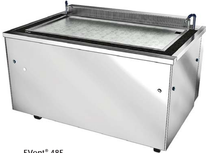
EVent® 48E Shown with Metal Surround & 36" Casters 10-0148-EVT 10-0150-EVT-FMS 10-0150-36