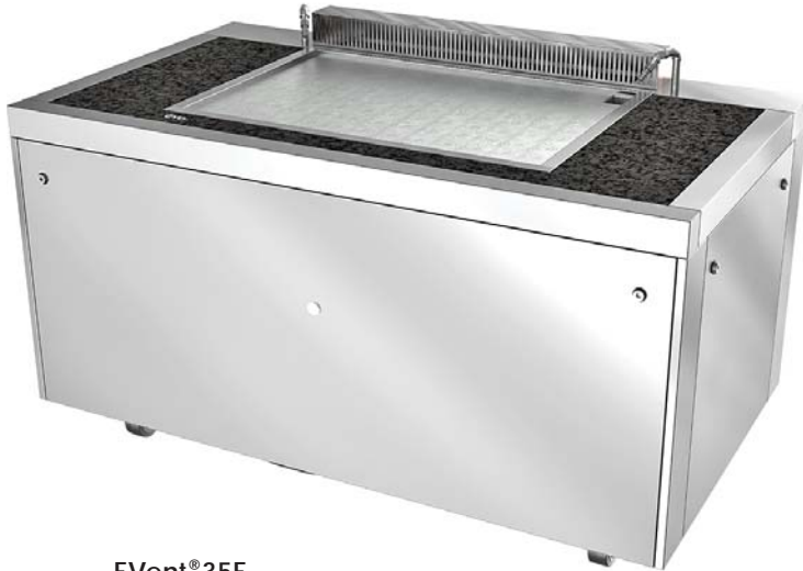
EVent® 35E With Integral Recirculating Ventilation System Model 10-0135-EVT